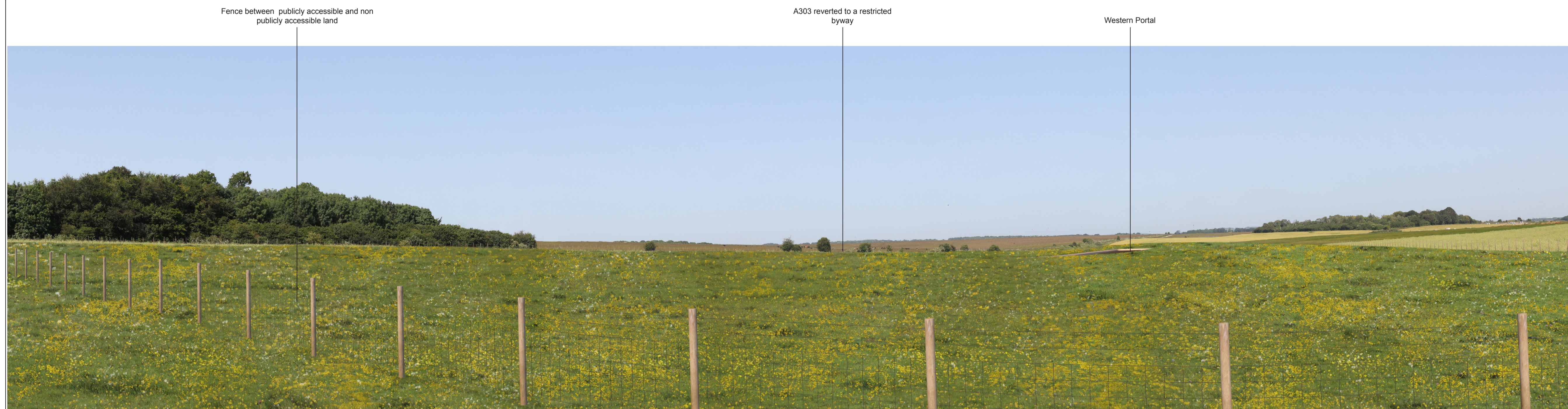
PROPOSED (SUMMER YEAR 15)